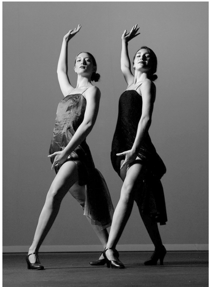
NORTH COUNTY CENTER

THE-230D CONTEMPORARY DANCE: ADVAN. INTERMEDIATE 2303 TTh 5:30PM- 5:50PM METZLER S OYC Rm ROOM 1 2.0 & TTh 6:00PM- 7:20PM