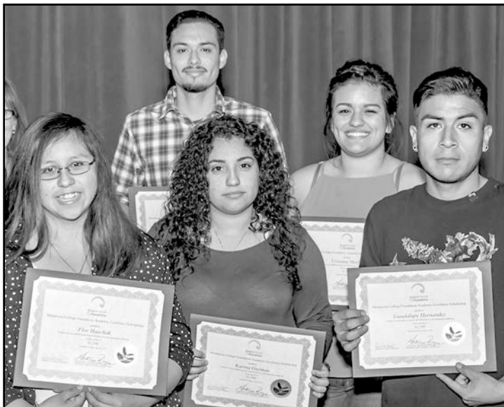
185 students were awarded 223 scholarships totaling $218,400 for the 2016-2017 academic year